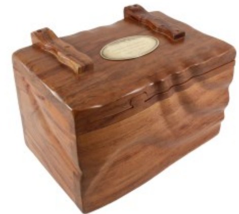
with Solid Wood "Trent" Urn £295:00