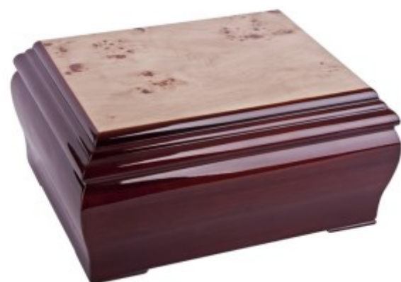
with Continental Casket £235:00