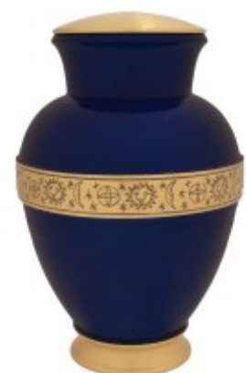
with Blue Harvest, Metal Urn £335:00