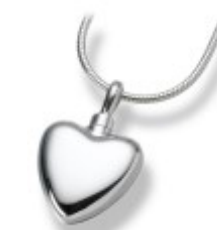
with Love Heart (no chain) £295:00

Our Prices Include for the Collection/Receiving of the Ashes, for taking responsibility for them and for storage on our premises for up to thirty days Subject to availability