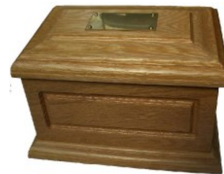
with Solid Oak Casket £215:00