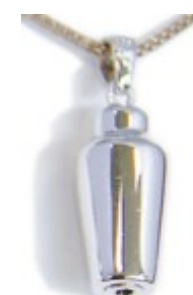
with Mini Urn Pendant (no chain) £265:00