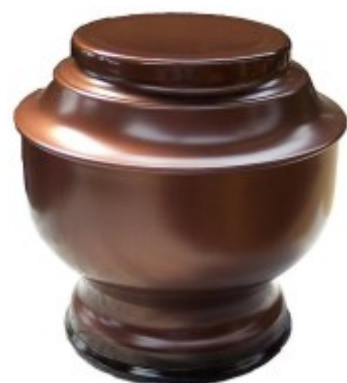
with Metal Spun Urn £175:00