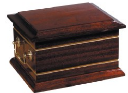
with Solid Wood "Lesbury" Urn £275:00

Our Prices Include for the Collection/Receiving of the Ashes, for taking responsibility for them and for storage on our premises for up to thirty days Subject to availability