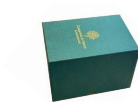
with Crematorium Box £60