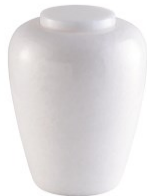
with "Simply Marble" Urn £275:00