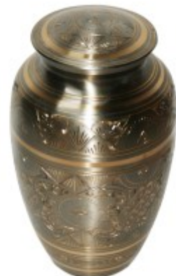
with "Sovereign" urn £270:00