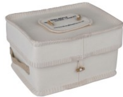
with White Woollen Urn £225:00