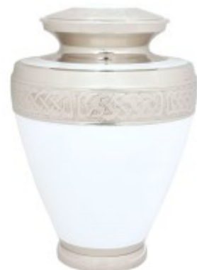
with Brass "Marble White" Urn £275:00