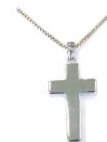
with Cross (with chain) £265:00