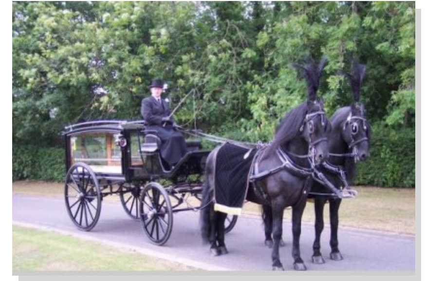
Horse-Drawn Hearse with a pair of Black Horses and black Hearse. Additional charge from: £1495.00