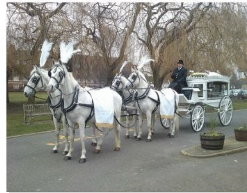
Horse-Drawn Hearse with 2 pairs of White Horses and a white Hearse. Additional charge from: £2155.00