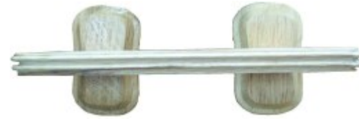
Set of Three Oak Bar Handles, and T-ends.£95:00