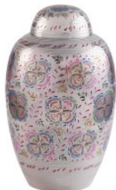
with "Grace" Urn £275:00