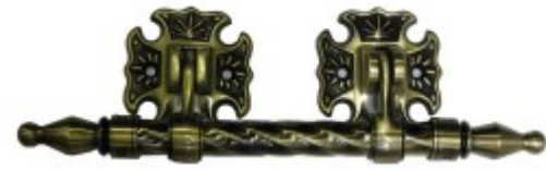
Set of Three Antique Brass Bar Handles, and T-ends £185:00