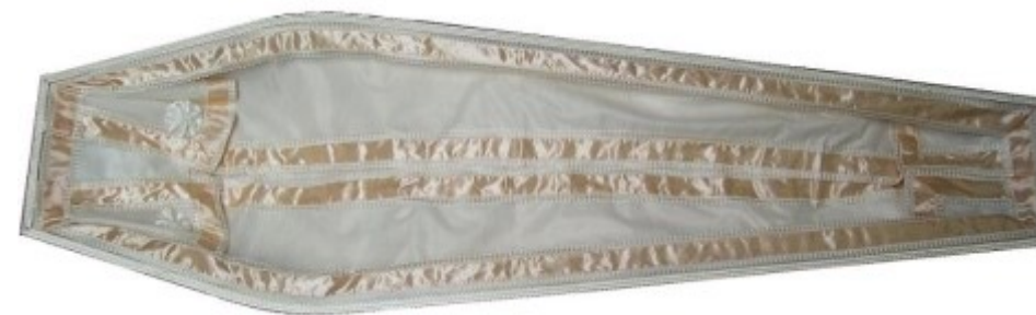
A Coffin Interior