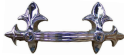
Set of Three Nickel Finished Fleur Handles.