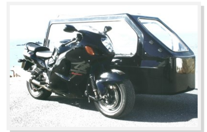
Motorcycle Hearse. Additional charge from: £1355.00