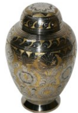
with Ambassador Urn £285:00