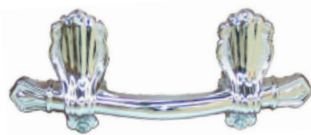
Set of Three Cast Metal Nickel Finished Doric Handles.