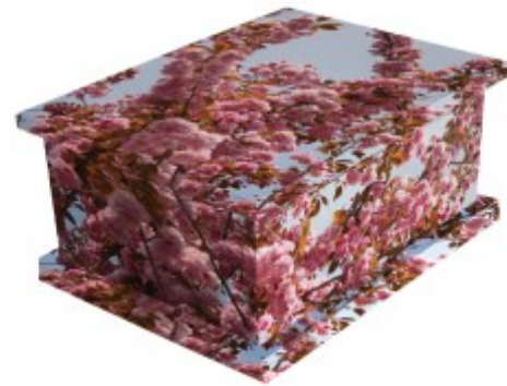
with Spring Blossom Casket £295:00