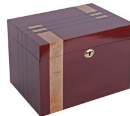
with Inlaid Wooden "Azure" Casket £255:00