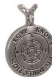
with Compass (with chain) £180:00