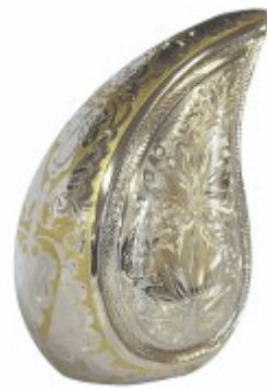
with Teardrop Patterned Urn £375:00 Inc. Keepsake - £455.00