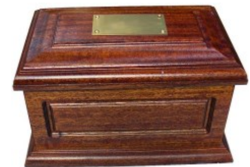
with Solid Mahogany Casket £215:00